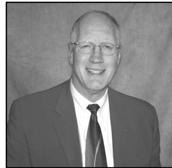
Mayor Bud Norris