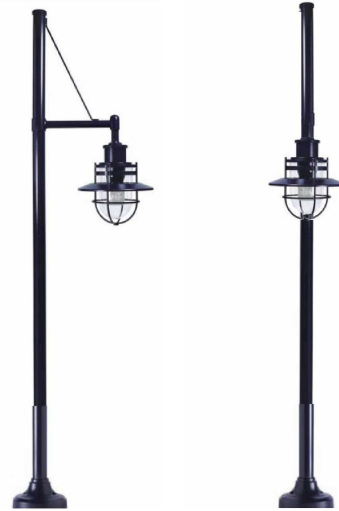
LIGHTING STANDARDS NO SCALE