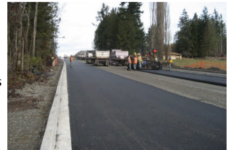
LaVenture Road Extension

Second, the City has extended LaVenture Road 1300 feet south from Fowler Street to Blackburn Road. The $1.4 million improvement project was constructed by Interwest Construction of Burlington and funded by grants awarded to the City by the State Transportation Improvement Board, Federal American Recovery and Reinvestment Act, and Skagit County Economic Development Grant funds. This is the first phase of a larger and regionally important project to connect LaVenture Road to the I-5 interchange at Anderson Road, and it is the result of a successful partnership between the City and Skagit County. One of the most important benefits of the full project will be its reduction of peak hour traffic on I-5 and College Way.