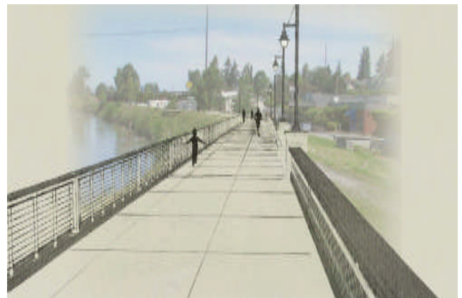
Skagit Riverwalk looking north towards Lions Park

We are continuing to work with FEMA on the Conditional Letter of Map Revision (CLOMR). This review process conducted by FEMA will insure us that our engineering and design meet the Corps of Engineer's design. We continue to aggressively pursue other funding through both the state and federal programs to complete the entire project. We are asking for $8.8 million. I invite you to come in and view the latest design plans for the flood protection project and riverwalk.